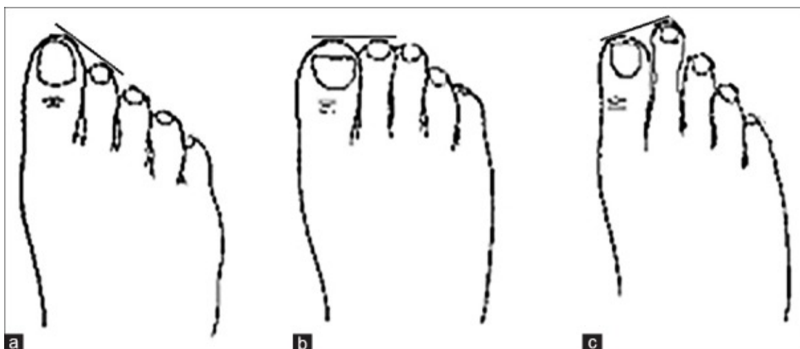
(a) and (b) normal or long big toe, (c) Morton's or short big toe